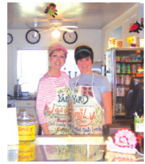
Two of the owners of The Yard.

The Yard is famous for one special sweet: their frozen custard. The custard flavors include chocolate and vanilla and is home made in the shop. If you want to know more about the menu, hours, or activities, you can go to their website www.theyardshops.com.